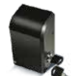
LATCH & STOPPER